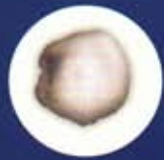
actual 8 micron dust particle magnified 1,500 times

*American Society of Heating, Refrigeration and Air Conditioning Engineers (ASHRAE) Guide